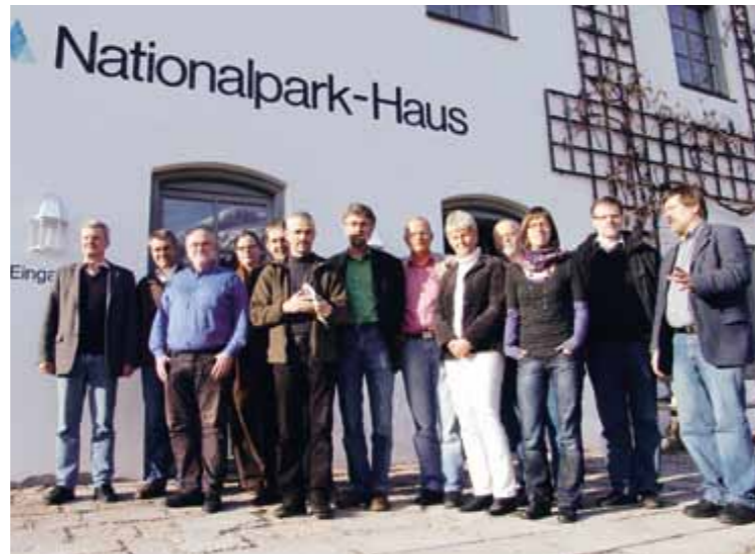
Committee members on the side visit to Berchtesgaden National Park

More time would have been desirable from the committee member's point of view in order to better mutually prepare for the evaluations. Moreover, there were no fixed evaluation teams separated from the purpose of the task; the committee members mainly had to fulfil this task in addition to their other