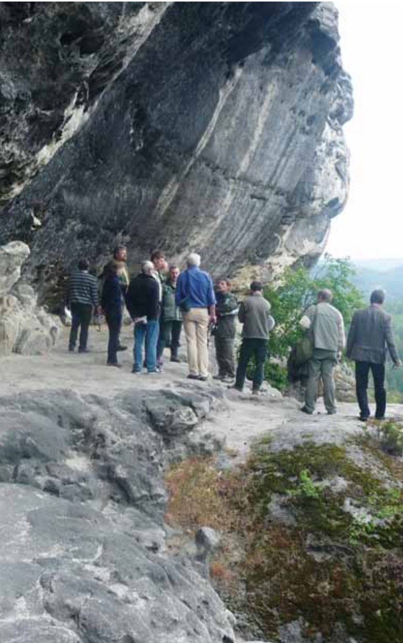
Committee members during the site visit at Saxon Switzerland National Park

Overall, the first evaluation of German national parks - which was voluntary - has been a success and is giving impetus for the further development of those areas. However, in addition to the many strengths of the evaluation process, smaller weaknesses also became obvious; these could not have been avoided by the initial implementation of such a complex process. It is possible to include the experiences in future evaluations through an internal documentation of the process and its intensive discussion. The evaluation of all national parks proved to be extensive and required a period of three years. Thus it seems appropriate to aim for follow-up evaluations on, approximately, a ten-year-cycle.