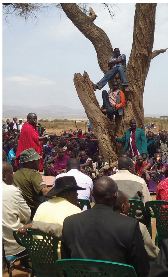
At a community meeting in Amboseli, stakeholders discuss anti-poaching problems and other wildlife issues.

Finally, the project will build the technical anti-poaching capacities of biosphere reserve managers. This will be done through a workshop gathering select managers and a visit to a biosphere reserve to learn firsthand about successful cross-border anti-poaching operations. AWF will further produce policy briefs to show how biosphere reserves can serve as model regions for anti-poaching in Africa.