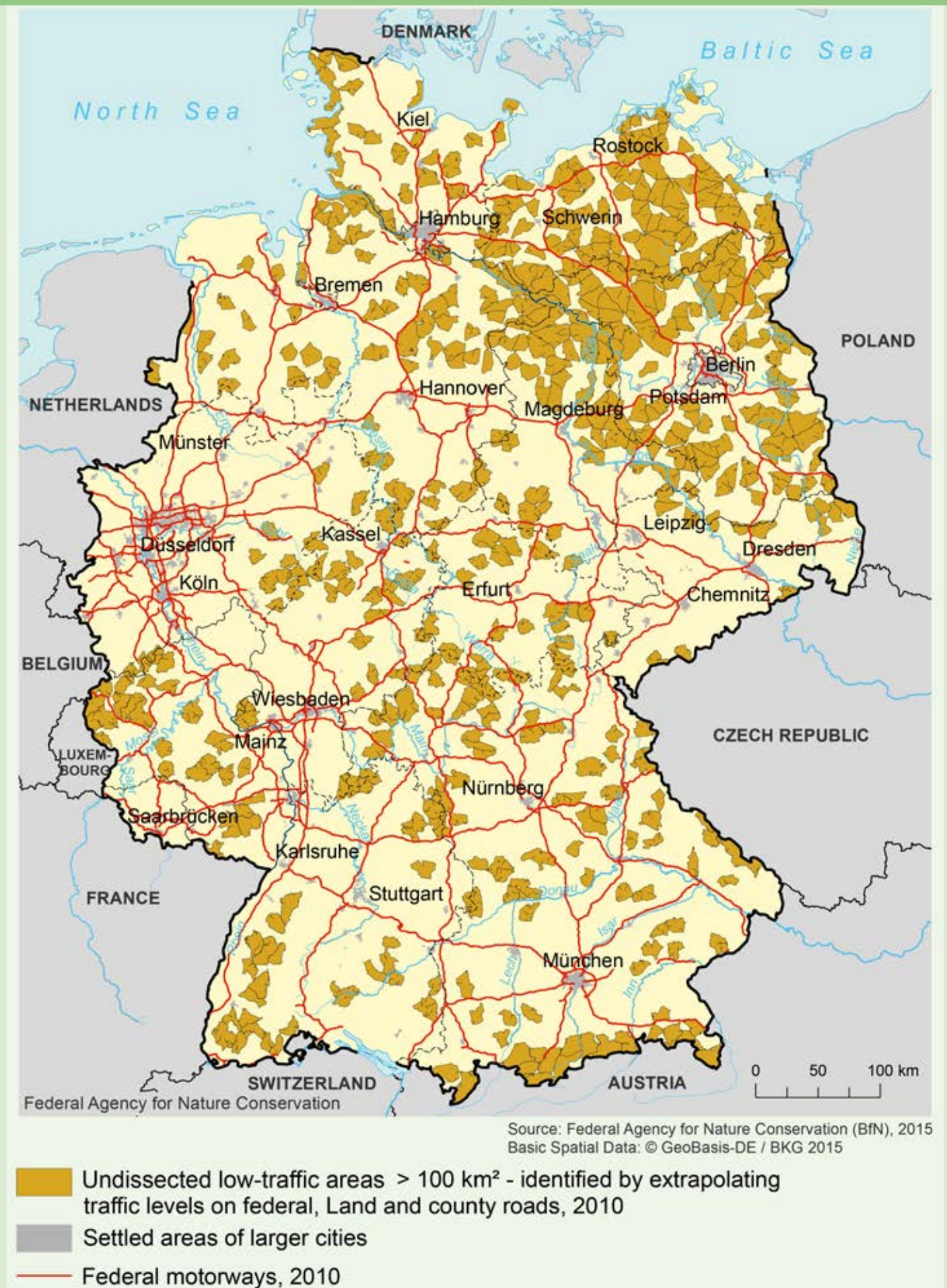
Map: Undissected low-traffic areas > 100 km 2 in 2010 (Daten zur Natur 2016)

Apart from this, landscape segments are to be highlighted in which developments largely undisturbed by the influence of human uses are made possible and that consequently (are