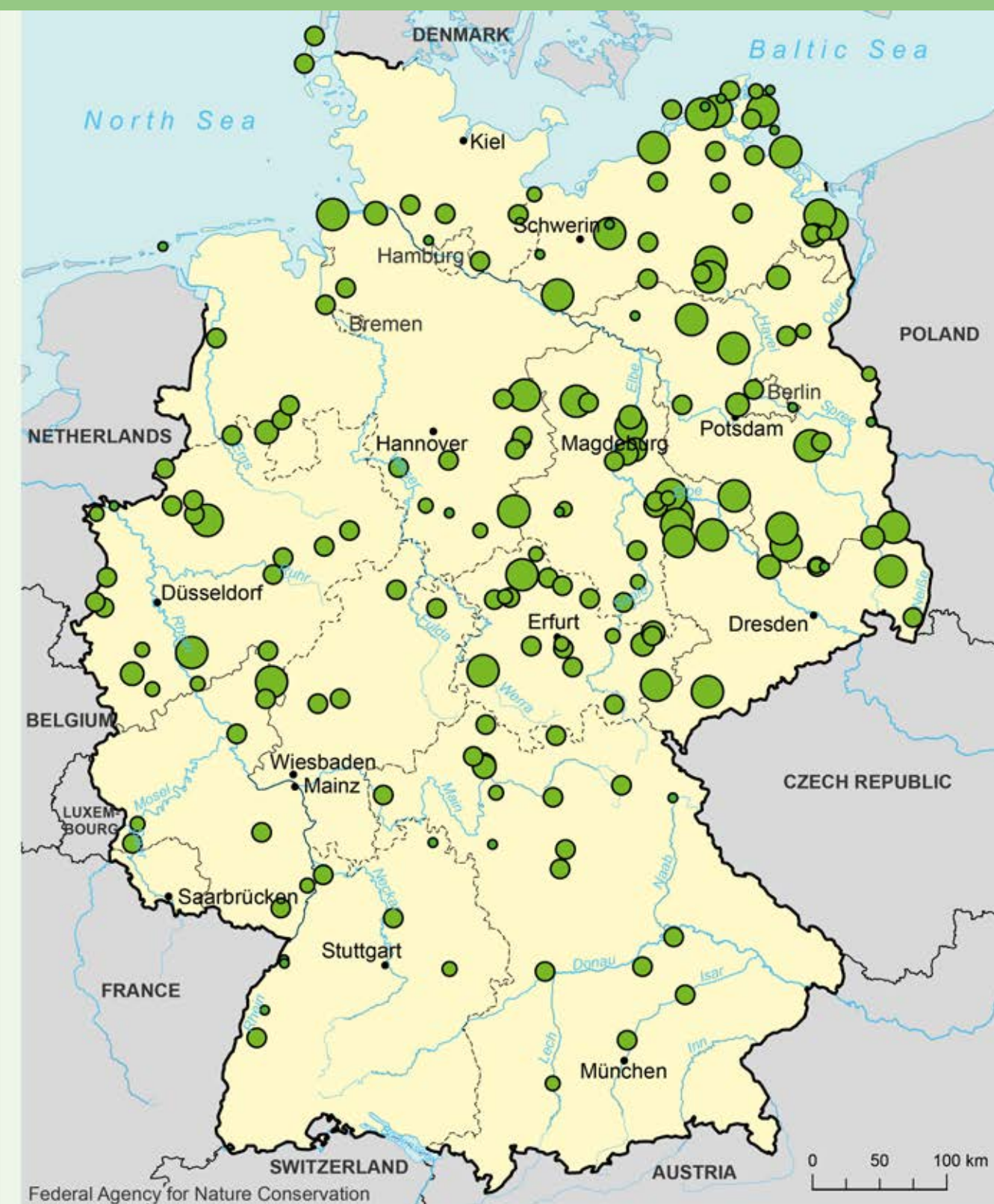
Federal Agency for Nature Conservation Classification of sites by size Figures in hectares

Currently, an areally precise cartographic representation is not yet possible because the detailed inventory of sites is still being prepared at present.