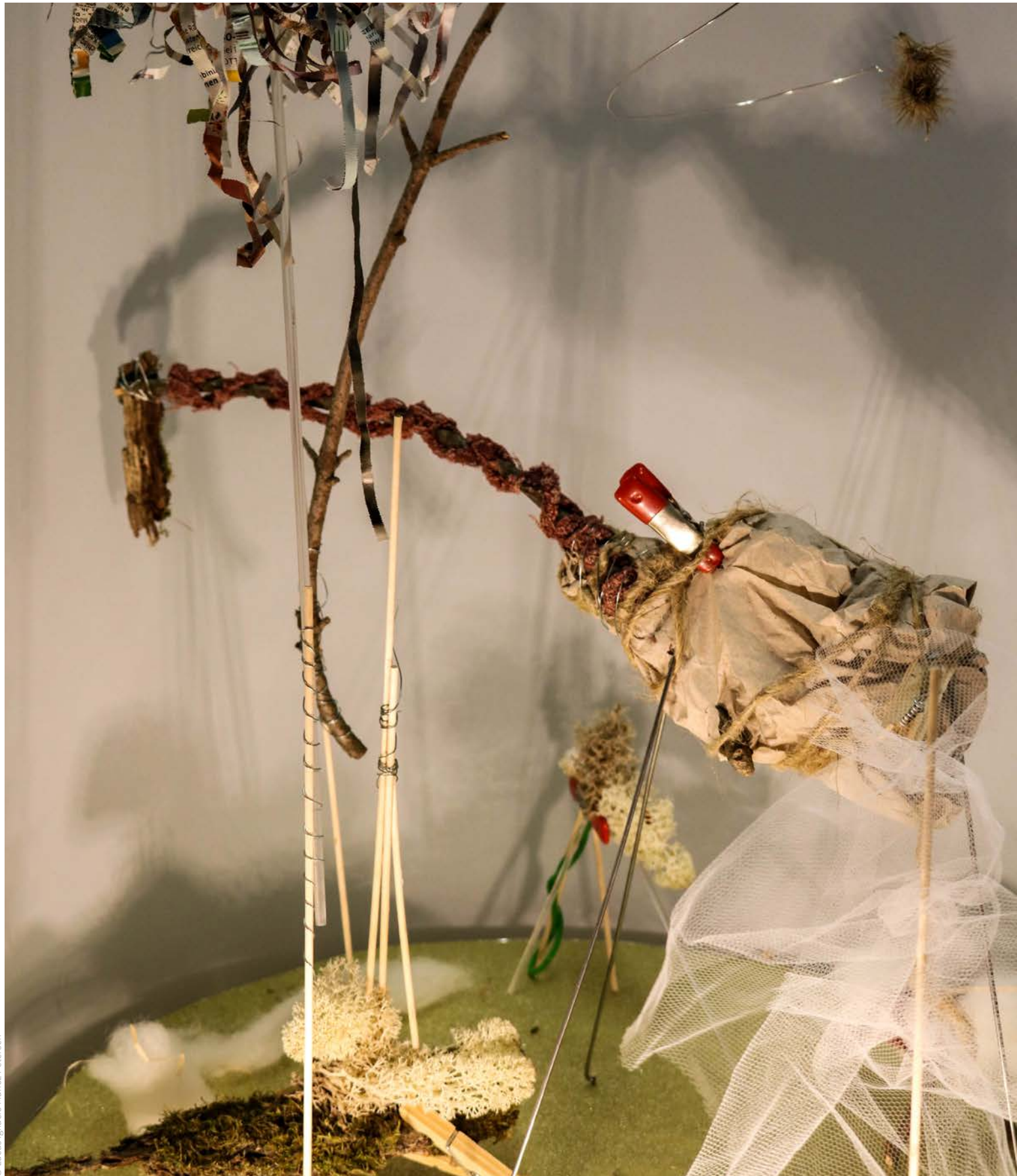
This abstract interpretation of a Biosphere Reserve was created during the conference at a workshop held by artist Ilona Kálnoky.